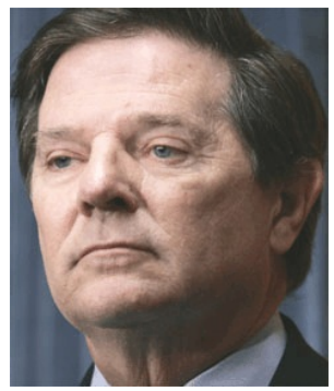
What Tom Delay did in Texas is perfectly legal in Oregon.

The result is that corporations dominate politics in Oregon . They outspend labor unions by 5-1 and massively outspend all other groups and causes, including those for better health care, environmental protection, human and civil rights, decent and living wage jobs for all, consumer protection, fair taxes on corporations, less promotion of gambling, and sufficient funding for education and other needs.